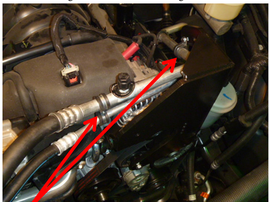
Install the O.E.M. belt according to the O.E.M. belt routing.

Install clamps(19,20) using bolts(21), lock washers(22) and nut(23).