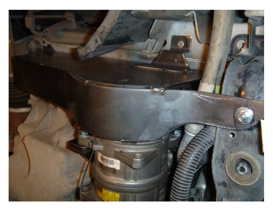
Install new splash shield reusing OEM bolts in frame and (1) 1/4 \times 3/4 bolt, (2) 1/4 flat washers, (1) 1/4 Lock washer and (1) nut in radiator supports as shown. Replace engine coolant.

After belt is installed, loosen the idler bolt slightly and then rotate eccentric 180 deg. as shown above and retighten idler bolt. It may be necessary to actuate tensioner in this process. This is done in order to make belt installation easier and then gain additional belt take up that is needed.