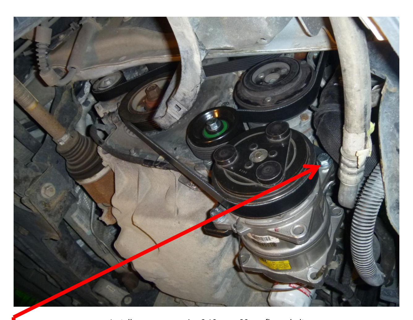
Install compressor using 3 10mm x 30mm flange bolts.

Secure the lower radiator hose by installing wire loom clamp (provided) using this bolt.