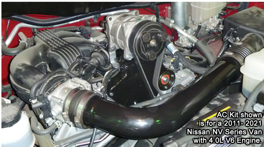
AC Kit shown is for a 2011-2021 Nissan NV Series Van with 4.0L V6 Engine.

CW offers Kits for Chevy, Dodge, Ram, Ford, Freightliner, International, Isuzu, Mercedes, Mitsubishi, Nissan, & Peterbilt.