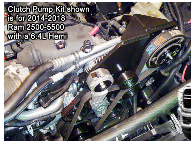
Clutch Pump Kit shown is for 2014-2018 Ram 2500-5500 with a 6.4L Hemi