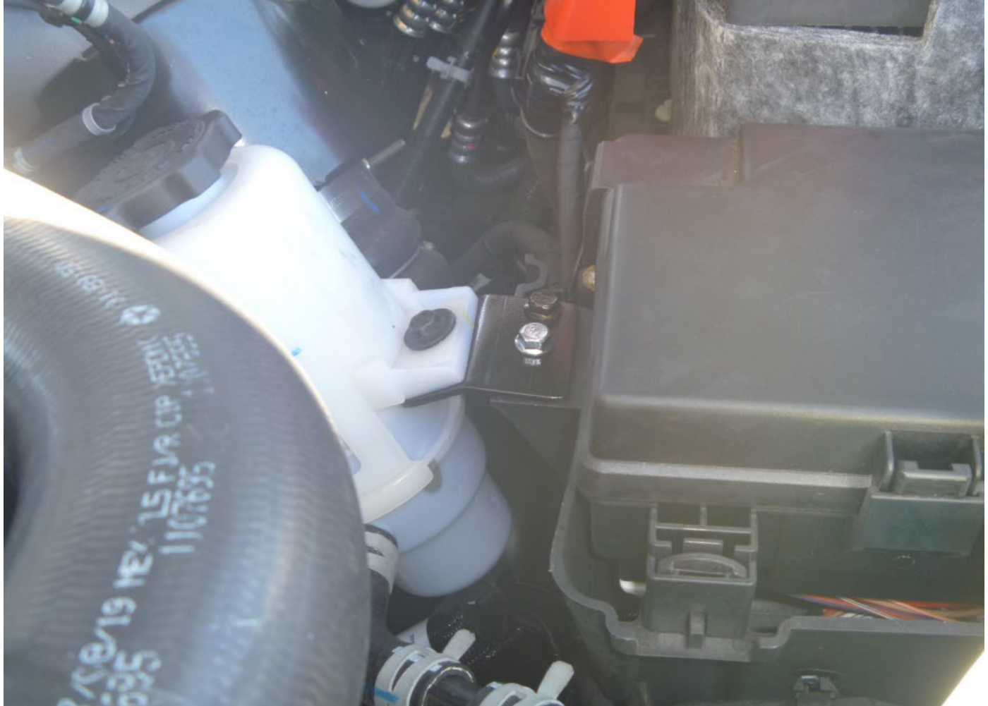
Power Steering Hose Clearance Hardware (19-20)

NOTE: Will NOT Work w/ Trucks Equipped w/ Lane Departure